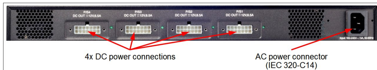
Figure 5. Rear panel of the RackSwitch G7000 RPS option

The rear panel of the RackSwitch G7000 RPS option is shown in the following figure.