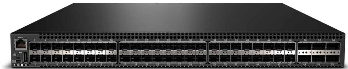
Figure 1. Lenovo RackSwitch G8272

The RackSwitch G8272 is shown in the following figure.