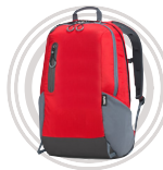
ThinkPad® Active Backpack Transitions Smoothly from the Office to your Active Lifestyle.