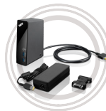
ThinkPad® OneLink Dock OneLink, Link it All.