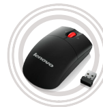
ThinkPad® Optical Wireless Mouse Mouse for All.