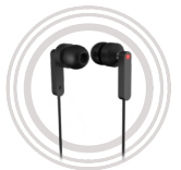
ThinkPad® In-ear Headphones Simple and Comfortable.